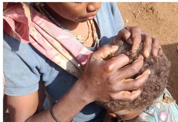
Figure 1 Teenage girl searching for and crushing head lice in a young child (East Kwaio mountains, Malaita Province, Solomon Islands).

Since we had difficulty locating evidence to inform local head lice guidelines in the Solomon Islands, we decided to do a systematic literature review of pediculosis in the PICTs. The aim of this review was to evaluate evidence in the peer reviewed literature on pediculosis due to head lice in the 22 nations that form the PICTs.